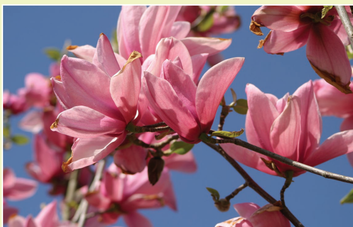
Magnolia 'Heaven Scent' is startlingly vivid against a clear blue sky.

Blossom trees can transform a garden each spring into a delightful showcase of colour and fragrance. Some flowering trees are covered with blooms for 2-4 weeks, while others offer a more limited display, some flower early before putting out leaves, while others bud and bloom at the end of spring, and still other trees put out flowers that are hardly noticeable, being purely for reproduction. We have chosen to only include trees that produce a lovely seasonal show of flowers in this list.