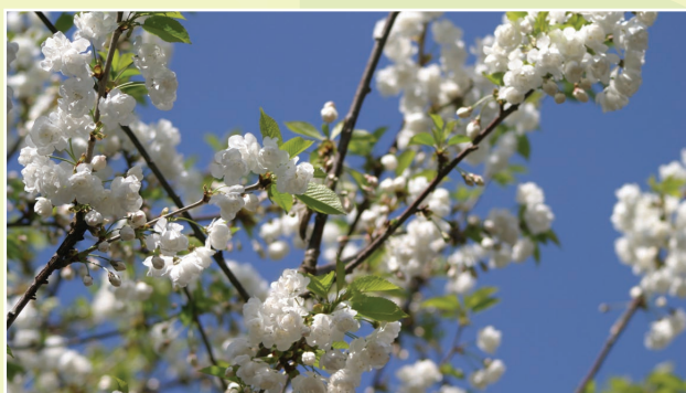
A cultivated form of our native Bird Cherry, Prunus avium 'Plena' gives the same natural effect with a delightful double white blossom.

Thank you for your interest in Majestic Trees. We are pleased to provide you with our current availability of trees. The trees detailed on the list are those we currently have in stock at our nursery. Numbers can and do change daily, so please call to confirm availability of particular stock. The heights and girths reflect actual heights and girths. Please be aware that there are some items that may not be available for planting immediately, if they are rooting out. These trees are indicated with an estimated date under the 'Available from' column. You may purchase them now as many customers do to get the pick of the litter, but we will not deliver until they have rooted out. We do not provide pricing on line but are more than happy to provide a price list upon request or quote for specific stock. We do not have a minimum order value. In order to more efficiently provide you a quote, please have the following information to hand when you contact us: