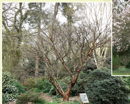
The multi-stem form of Acer griseum allows its characteristic peeling bark to be shown to best effect.